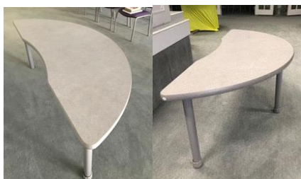
Dimensions: 58"W (widest point) X 22"D (back of table to inside oval) X 21"H.